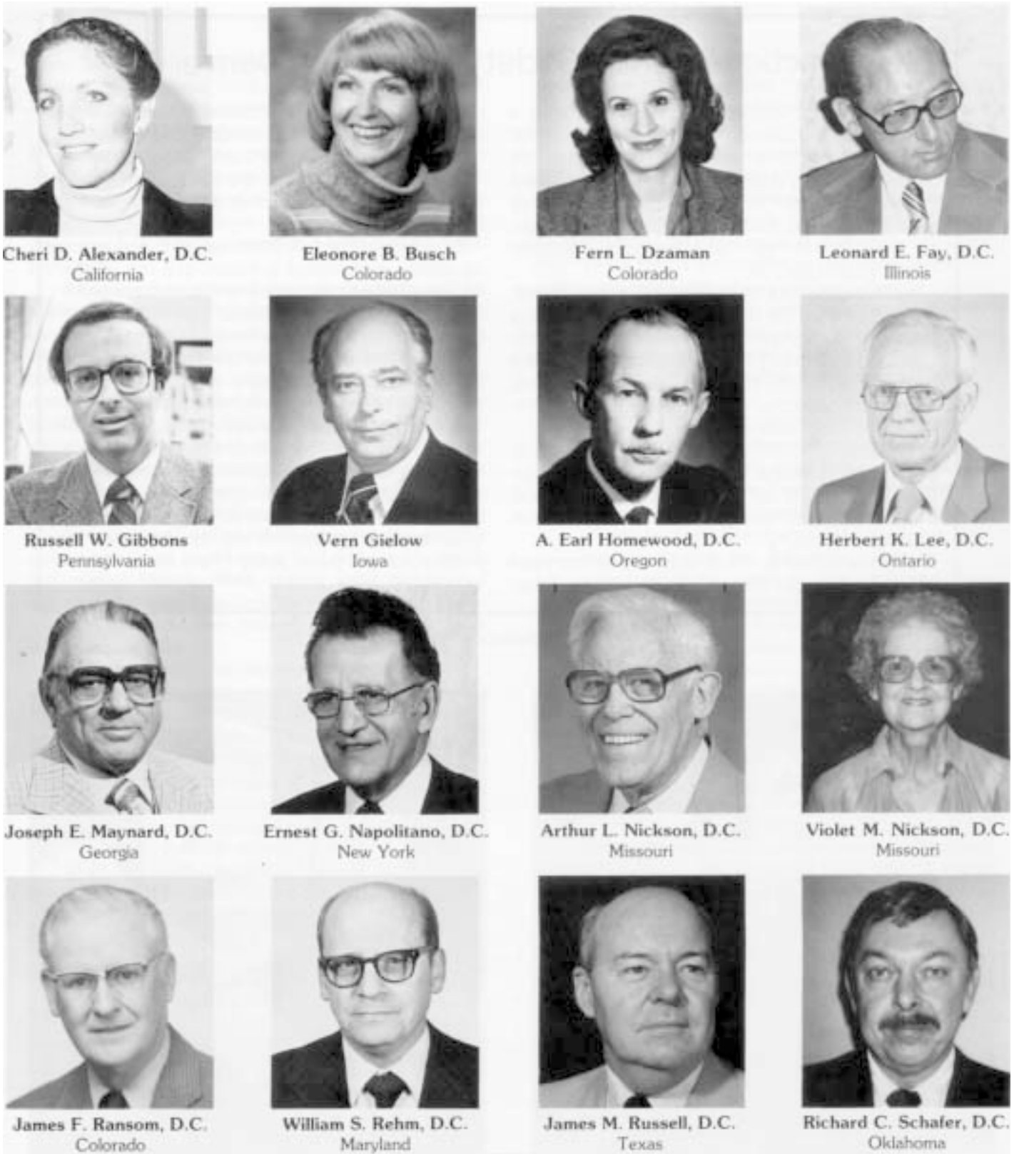
Figure 20 Founders of the Association for the History of Chiropractic