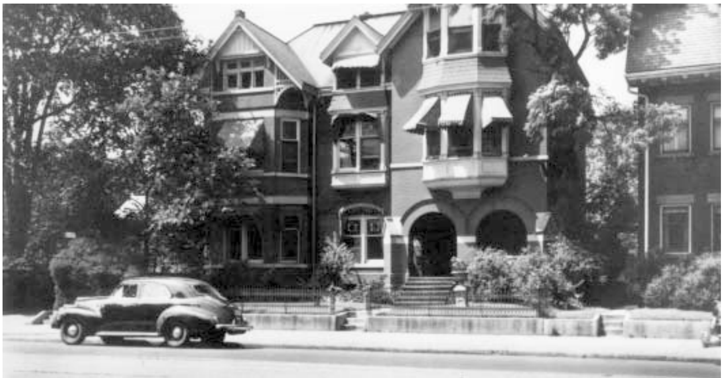
Figure 15 Campus of the newly opened Canadian Memorial Chiropractic College at 252 Bloor St., Toronto; from the October 1945 issue of the National Chiropractic Journal